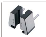
V-shaped jaws (included)