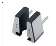
flat jaws (included)